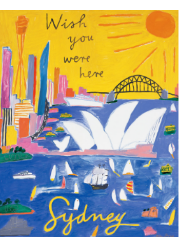
Postcard from Sydney, 1998, acrylic on canvas