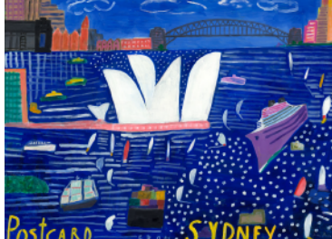
Postcard from Sydney, 2013, acrylic on clay board, 76.5 x 102cm