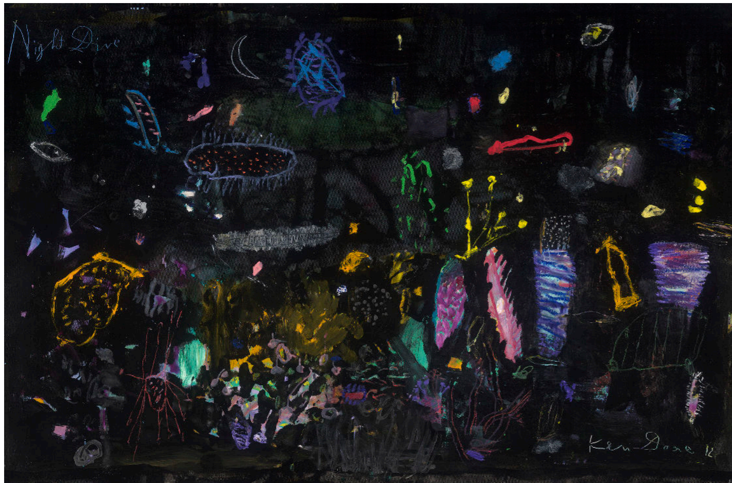
Night Dive I , 2014, oil, acrylic, enamel and oil crayon on linen, 120 x 181 cm

Artists sometimes add man-made parts to their landscape, such as houses, bridges, buildings, objects and modes of transport amongst others to give the landscape a sense of place and character.