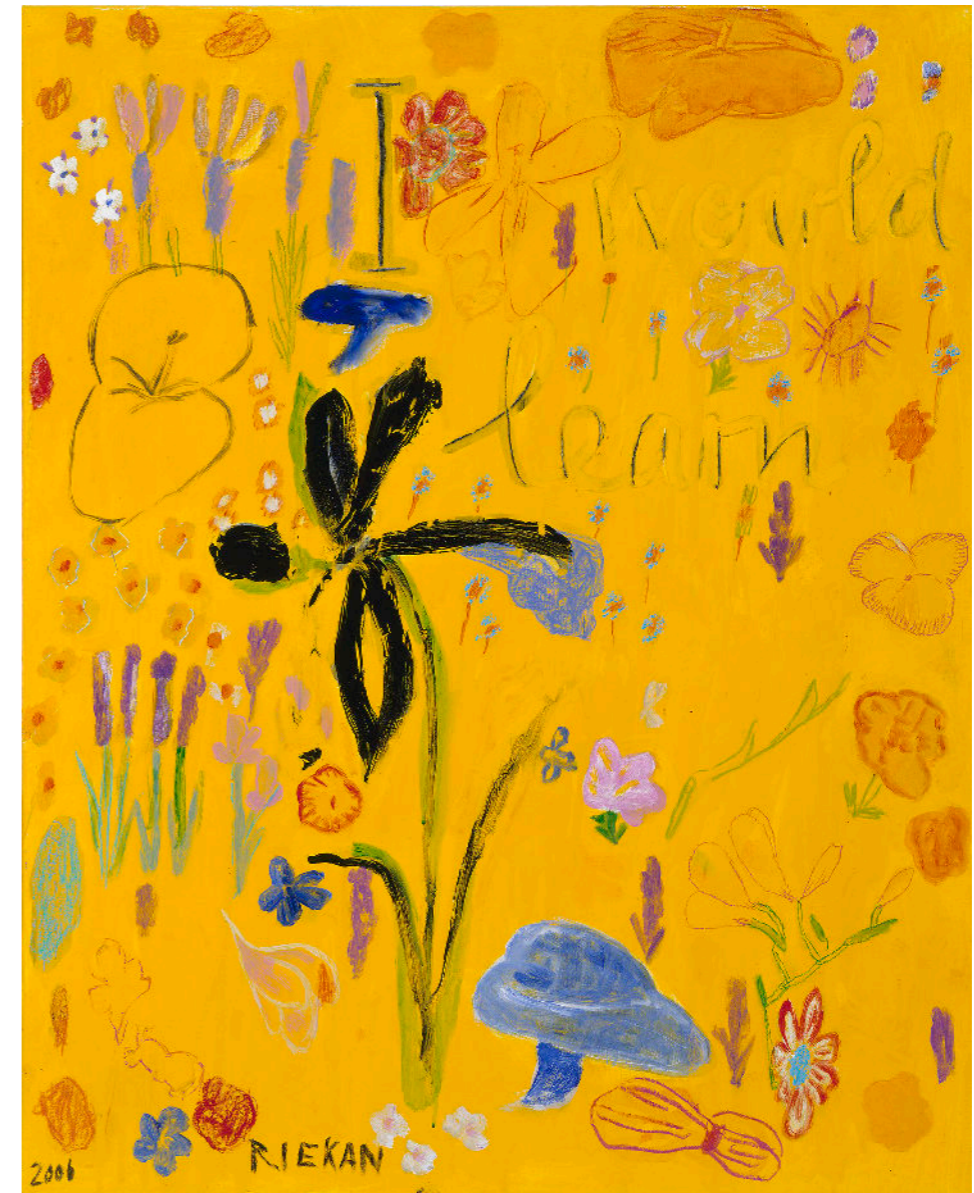
Butterfly dreams I, yellow , 2006, enamel and oil crayon on canvas, each 100 x 80cm (1 of 4 panels)

Artists are full of wild dreams and imaginations. They use theirs to explore new ideas. New colours, shapes, ways of creating and even inventing. Creating art is a way of showing and expressing their dreams.