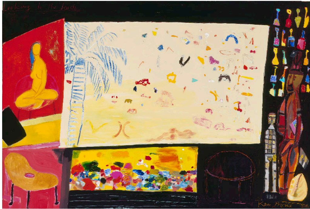
Looking to the Beach , 2005, oil and acrylic on canvas, 122 x 183 cm

Looking to the Beach is a great example of looking through Ken Done's world in his studio. We are transported to Ken Done's work space: we can see the room, dimly lit. There is a chair to the left and his colourful paint palette in the middle and a small round table next to it. To the right we see figures from Arnhem Land and Papua New Guinea displayed with his plastic sand spades, covered in blobs of paint, hanging on the wall.