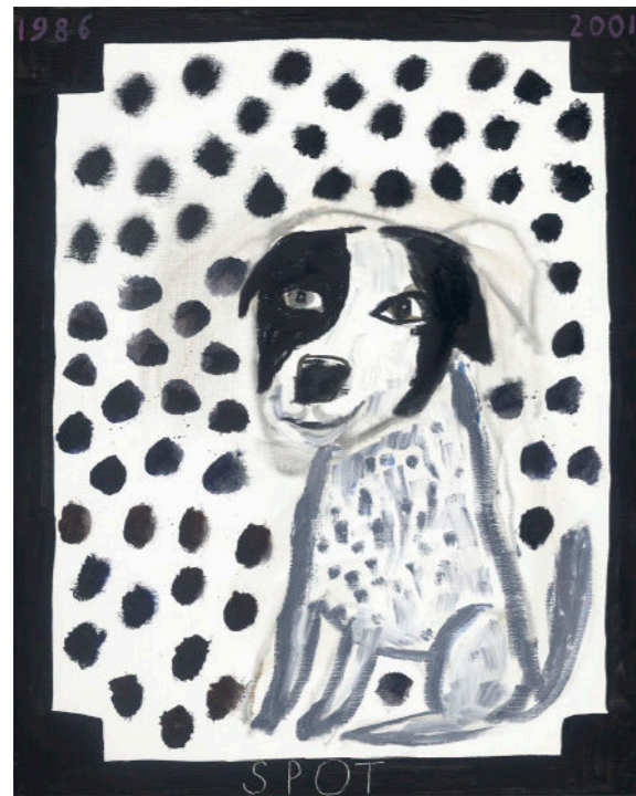
Spot, 2016, acrylic on linen, 100 x 80 cm