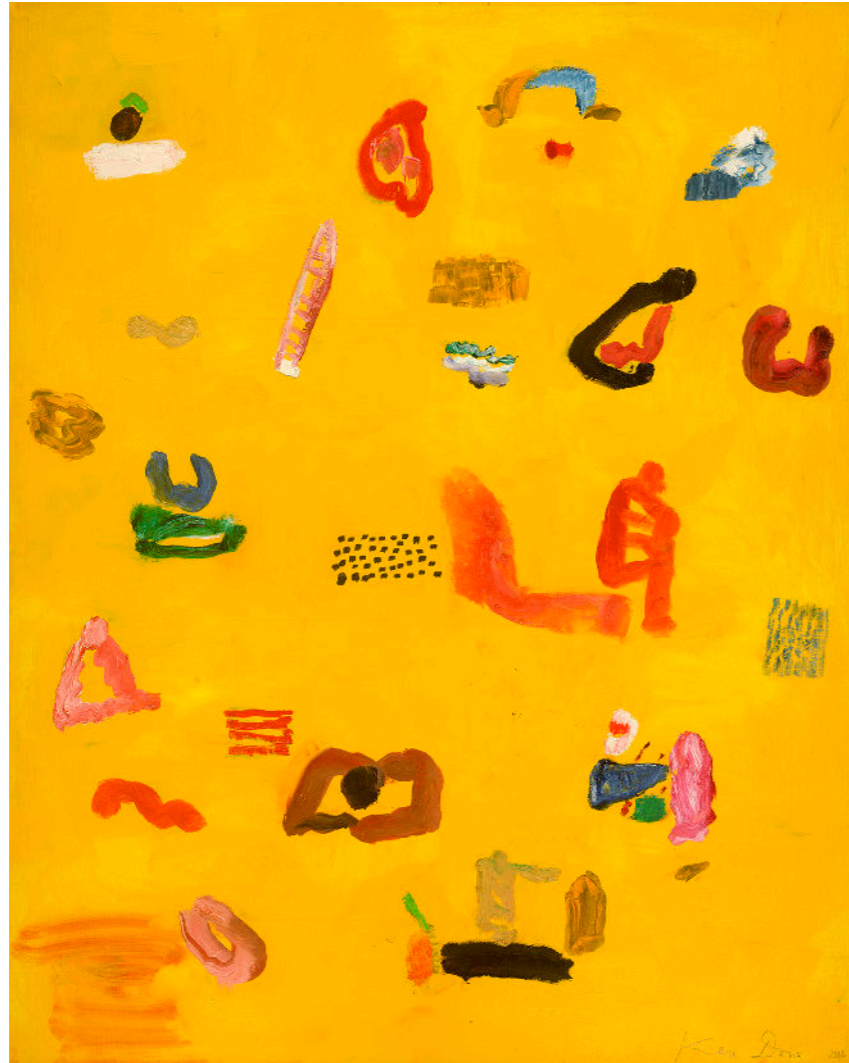
Yellow beach II , 2016, acrylic on linen, 152 x 122 cm

The beach is the quintessential landscape of Australia, and we are surrounded by so many. The yellow sands and the crystal blue waters reminds us of hot days in summer, holidaying with family and friends. In Yellow Beach II , we see the way Done observes the beach lifestyle and celebration of the life that Australia has to give.