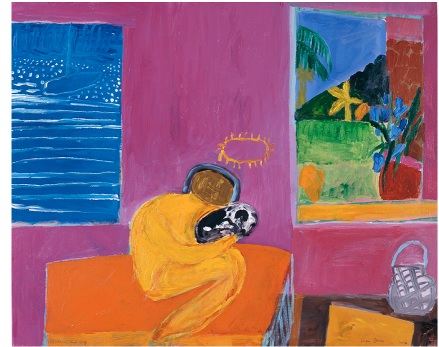
Madonna and dog, 2000, acrylic on canvas, 80 x 100 cm