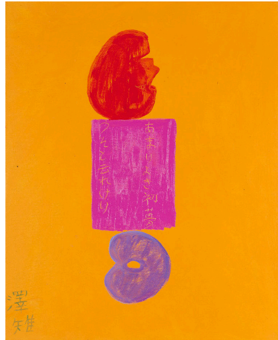
Haiku suite III: First Dream , 1996 – 2000, acrylic on canvas, 100 x 80 cm

Ken Done spent some time in Japan and exhibited his works there. He was inspired by the Japanese poetry writing known as Haiku .