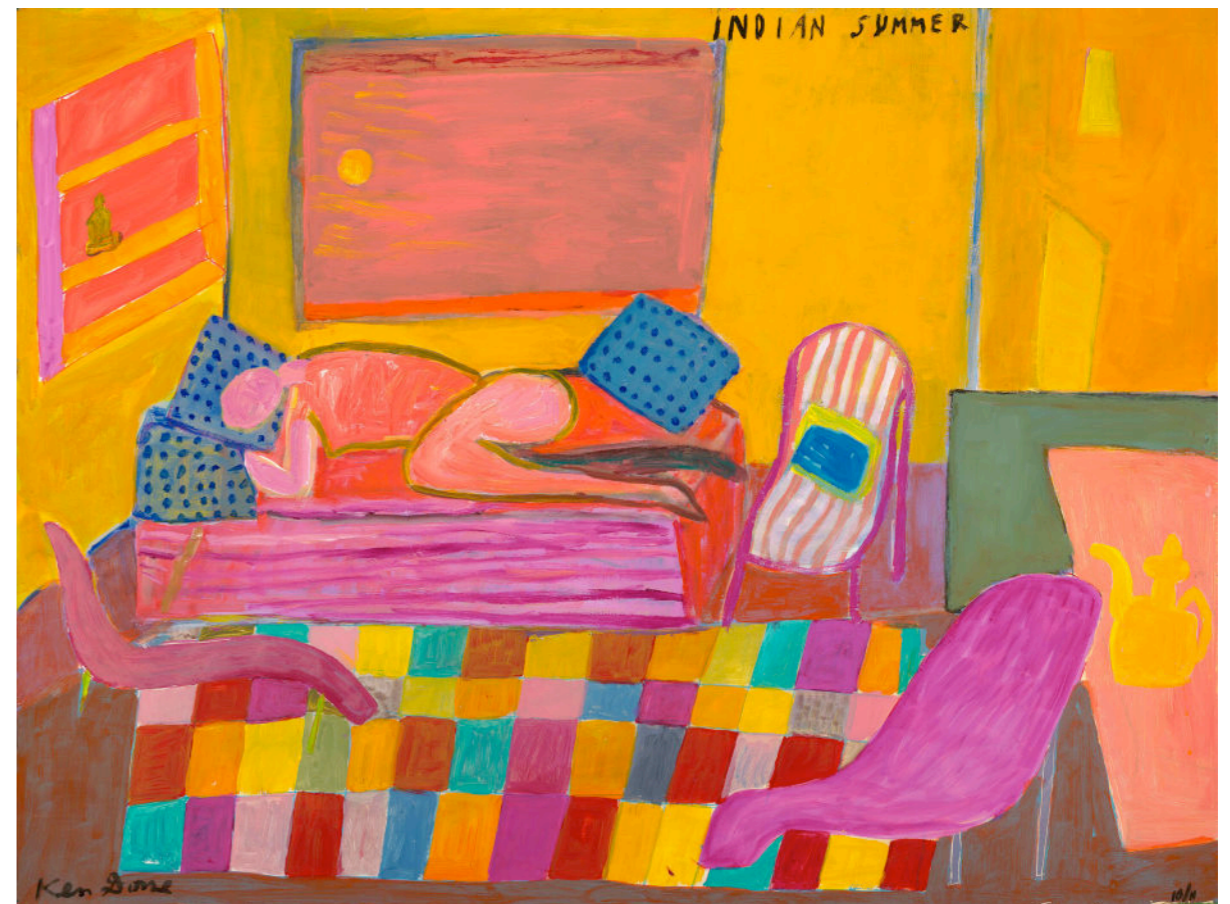
Indian Summer, 2011, oil and acrylic on canvas, 76 x 102cm